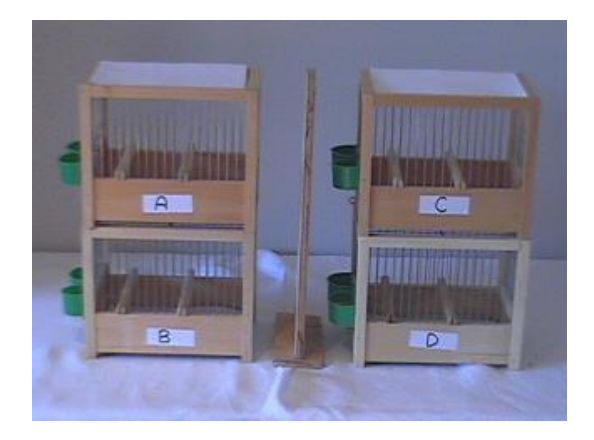
Boards are placed on top of the A and C cages. Cages are stacked A (top left), B (bottom left), C (top right), D (bottom right).