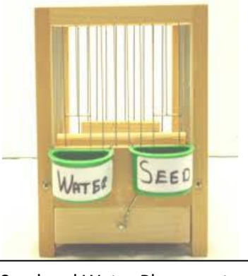
Seed and Water Placement