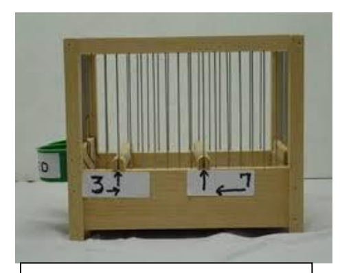
Perch Placement: 3rd wire from the left and 7th wire from the right, If these are not placed correctly, the bird cannot reach the water and seed

will be housed in the exhibitor's box during the contest.